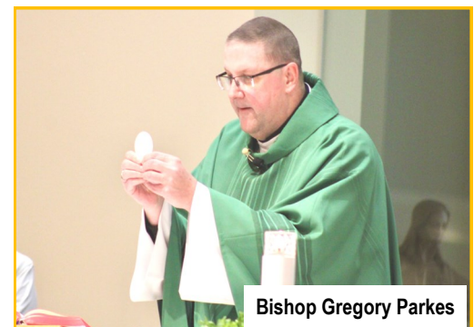
Bishop Gregory Parkes