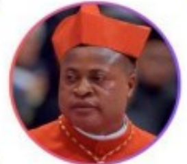
Cardinal Peter Okpaleke Bishop of Ekwulobia SPECIAL GUEST